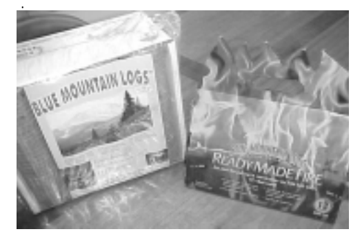
Redesigning a product: The old Blue Mountain Fire Log box—plain, lacking shelf presence and difficult to light, next to the more marketable new fire log package.

Mountain Valley has two subcontracted logging crews in the woods cutting full time. They supply the sawmill with enough wood to produce two million boardfeet of lumber annually. Both crews as well as the foresters attend SFI of PA training courses. ■