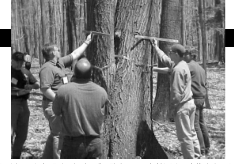
Participants in the Estimating Standing Timber course held in Prince Gallitzin State Park in Cambria County, measure trees on a series of forest plots and then estimate the board feet.