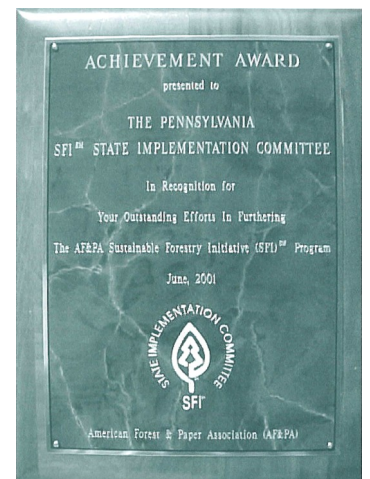
Pennsylvania's 2001 SIC Achievement Award