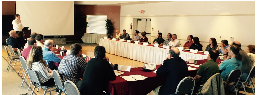
2015 Pennsylvania SFI Implementation Committee stakeholder meeting

The PA SIC has also evolved and continues to serve as the local face of the SFI program. It provides a forum where all segments of Pennsylvania's forest sector can come together to deepen their understanding of one another and work towards shared goals. It provides a means for SFI Certified Organizations to effectively address their commitments under the SFI standard, ensuring critical initiatives like logger training, forest landowner outreach, public education, and the resolution of inconsistent practices complaints are carried out consistently and efficiently.