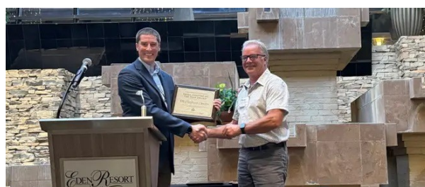
The California Chapter of ACF was recognized with the 2025 Small Chapter of the Year Award, sponsored by SFI.

The Association of Consulting Foresters of America, Inc. (ACF) recently held their annual 2025 National Conference in Lancaster, PA. Through a new partnership that reflects a shared mission to advance responsible forest management and promote professional excellence in forestry, the Sustainable Forestry Initiative became the sponsor of the Association's annual Chapter of the Year Awards. The Small Chapter of the Year Award honors one of ACF's chapters with fewer than 20 members for excellence in engagement, outreach and leadership, while the Large Chapter of the Year Award recognizes one of ACF's chapters with more than 20 members.