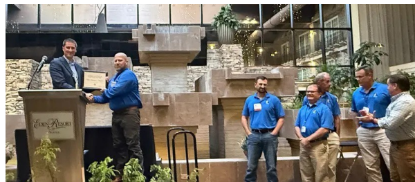
The Alabama Chapter of ACF was recognized with the 2025 Large Chapter of the Year Award, sponsored by SFI.