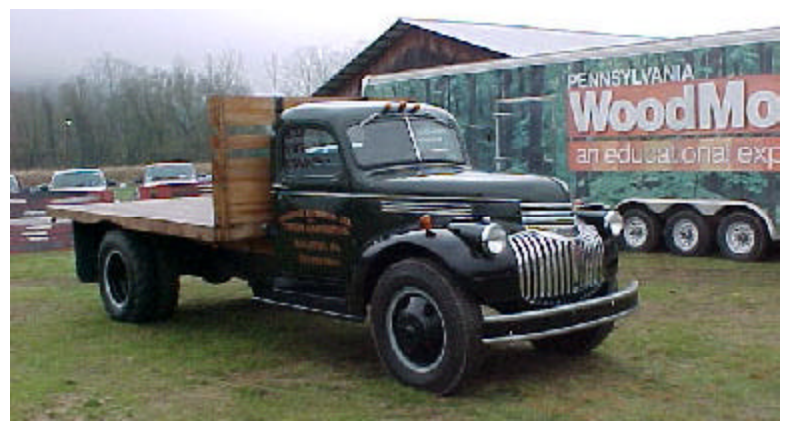
This 1946 Chevy truck owned by Brooks Lumber Company in Ralston, and the Woodmobile in the background were two very popular attractions for both young and old. The Woodmobile, provided by the PA Hardwoods Development Council, helps to educate the public about our vital forest resource.

On Saturday, October 23, 2004, the Log-A-Load-for Kids program was the focus of attention as the Second Annual Northeast Woodsmen's Day was held at the Mountaineer Park in Monroeton, just south of Towanda. Organizers managed to create a day full of events and activities and in the process they raised more than $14,000 to benefit seriously ill children across Pennsylvania. While the day started out cold and cloudy, by 11am the sun was shining brightly and the activities were in full swing. We congratulate all who helped to make this event such a huge success and we look forward to being there again in 2005.