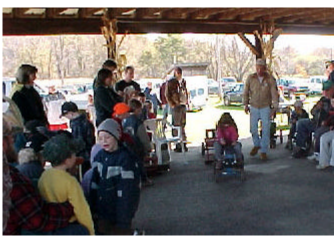
Anyone who has ever attended a County Fair can recognize a good old tractor-pull when they see one, and the large number of young competitors involved in this competition made for a great deal of excitement.